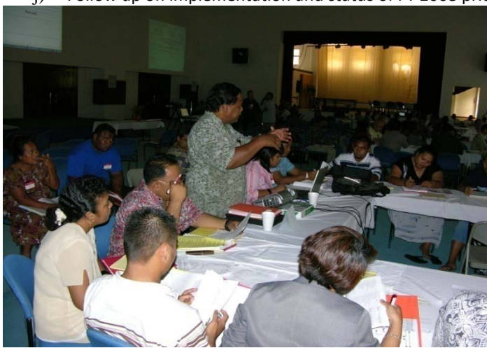
Figure 2. Breakout sessions