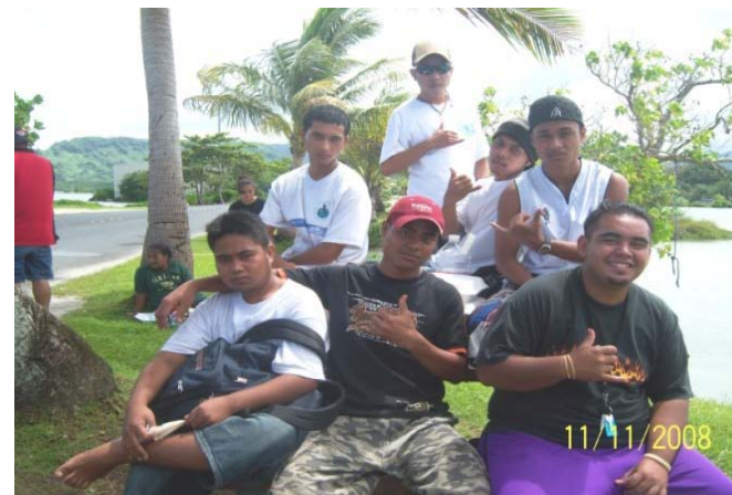
Figure 9. Phi Theta Kappa Students during Clean-up Activity