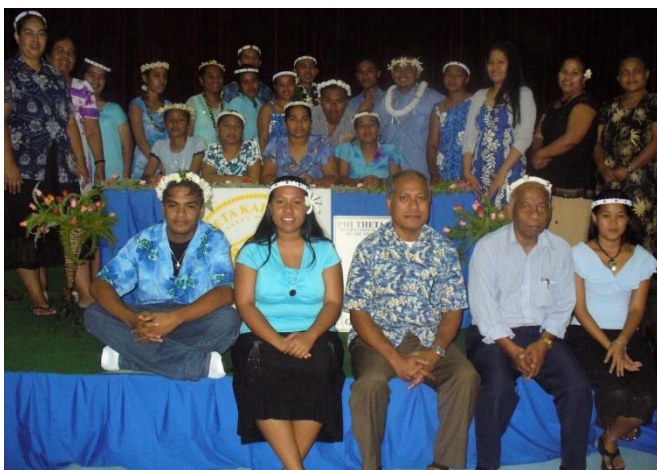
Figure 10. Phi Theta Kappa Induction Ceremony