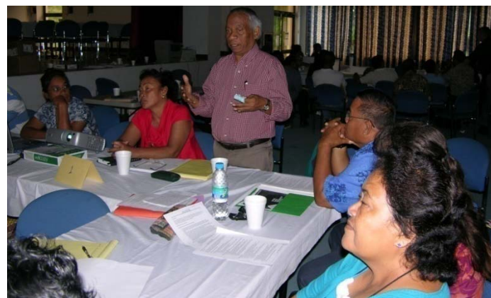
Figure 4. President James Involved in Retreat Discussions