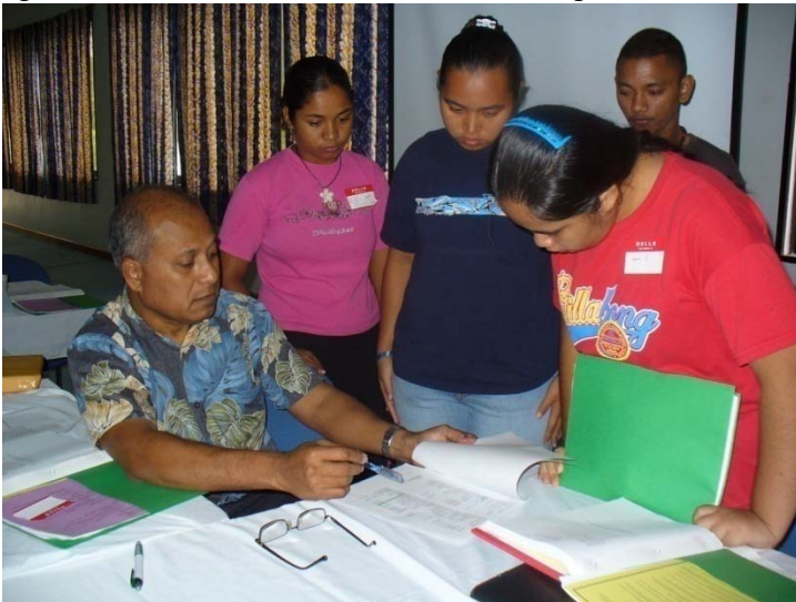
Figure 1. VPSS Consult with SBA Members during Retreat

The Presidents retreat was held at the FSM-China Friendship Sports Center from May 13-15, 2008. Acquiring members of both National and state campuses, which consisted of faculty, staffs, students, and the key stakeholders of the college. This year's President's retreat main objectives are as follows: