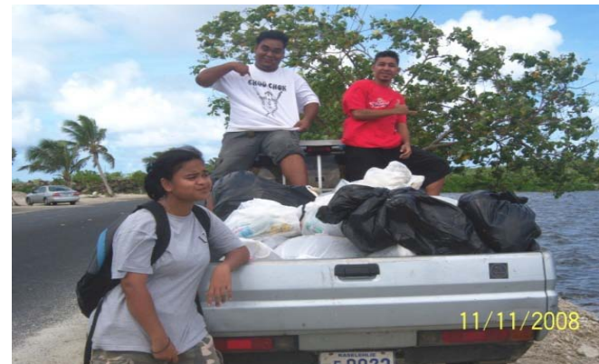
Figure 8. Phi Theta Kappa Students Cleaning Causeway

successes, to educate, and, above all, to take personal responsibility for the world around you. If we accomplish this together, we will all be doing our part to keep Micronesia beautiful.