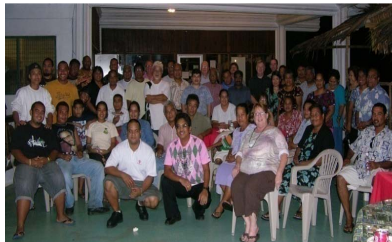
Figure 3. Participants during Retreat Reception at Nahntelik Restaurant The breakout sessions had a great impact on the retreat as it allowed the participants to have a more in depth discussions on the issues affecting the college.