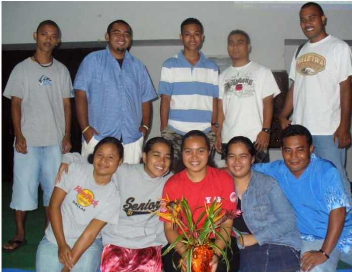
Figure 5. SBA Officers from all Campuses Attended President's Retreat 2008