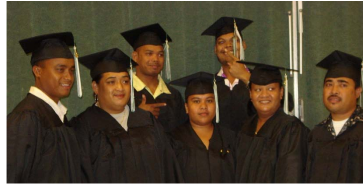
Figure 6. First Graduates of the Partnership BA Program