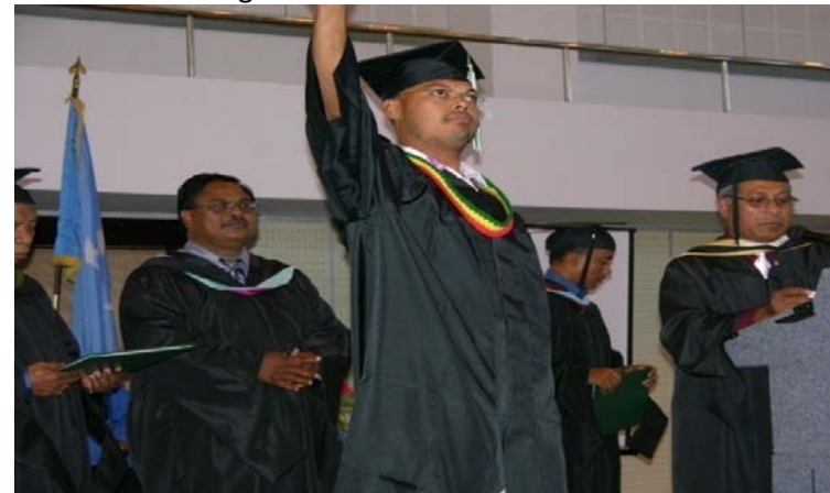
Figure 7. Moment of Truth